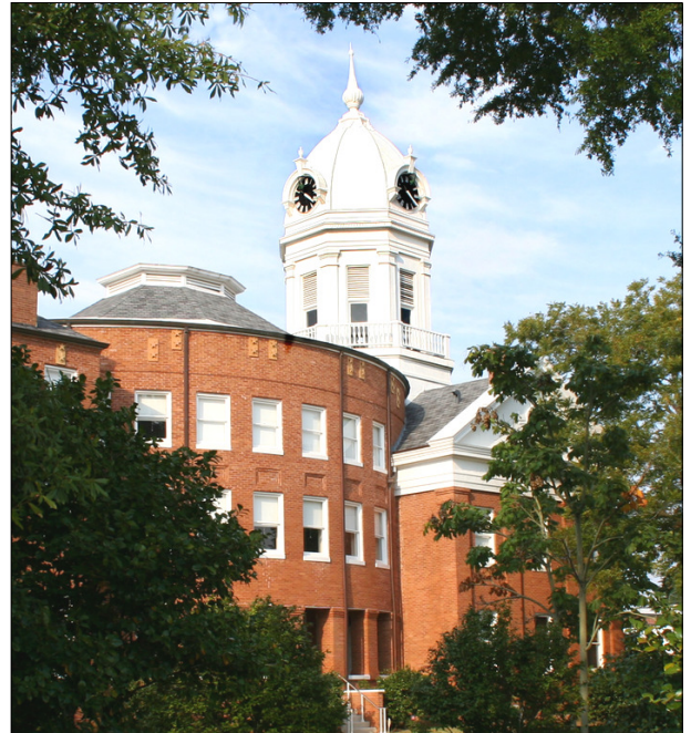
Old Courthouse Museum on the downtown square